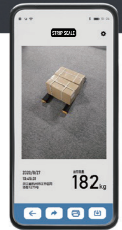
Photo & share

(if you need more functions, please contact with us)